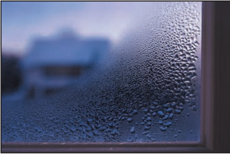
Condensation on the inside of a window-pane.