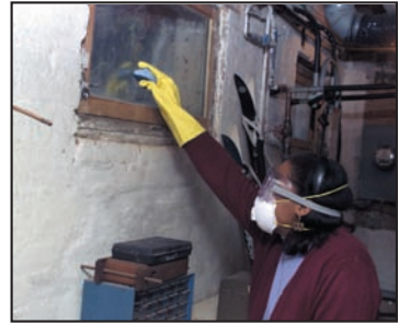
Cleaning while wearing N-95 respirator, gloves, and goggles.

■ Wear goggles. Goggles that do not have ventilation holes are recommended. Avoid getting mold or mold spores in your eyes.